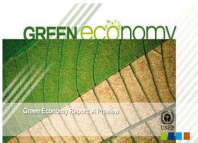
Green Economy Report: A Preview