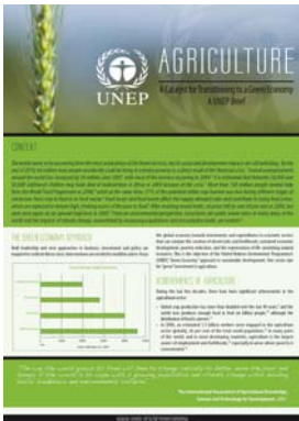
UNEP Brief: Agriculture: A Catalyst for Transitioning to a Green Economy

Agriculture: A Catalyst for Transitioning to a Green Economy