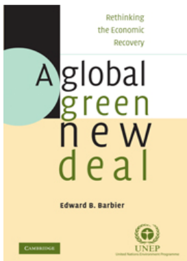
A Global Green New Deal: Rethinking the Economic Recovery