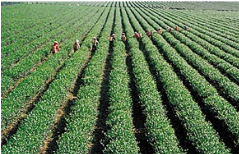
Green field, Vietnam.

Finally, it is important to examine how the results of an integrated assessment translate into policies, and the extent to which those policies maximize net development gains.