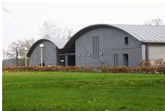
Amphithéâtres de l'Europe

By bus: Number 25-48, Amphithéâtres By car: on E40 to Liege, follow 'ULG Campus Sart Tilman'